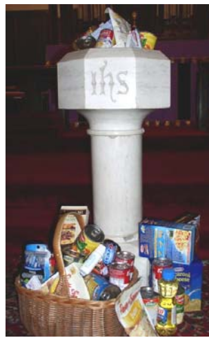
The Baptismal Font at St. James with food for the CRC

Please continue to bring canned and other nonperishable food items to be delivered to the Clintonville Resource Center food pantry. Needed especially this month are tuna and fruit juice. Also, non-food items are always welcome, as the Food Assistance Program does not cover these items (think cold and flu season, think facial tissue!). Please bring your donations to mass on Sundays or Wednesdays and place them in (or around) the baptismal font before mass or as you approach the altar. Our baptism calls us to service. What better image could remind us of that vocation than a vision of our gifts to help meet the needs of others in the very font that reminds us of God's gracious gift of new life to us in Jesus Christ!